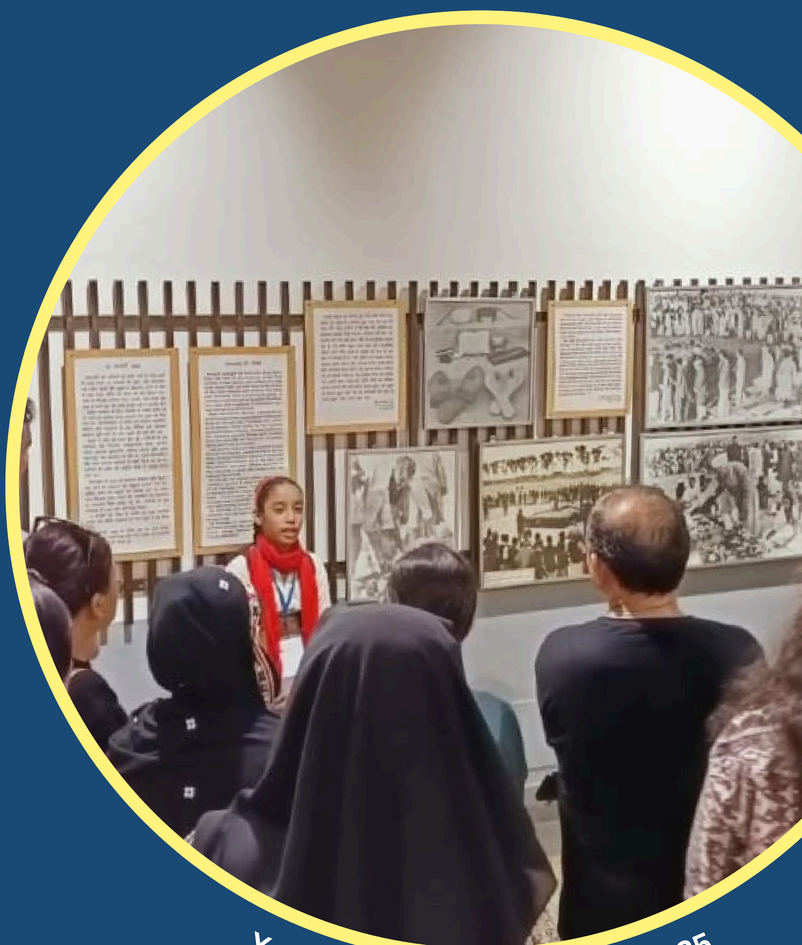
Young Student Guide from 2025

Certification by ITIHAAS and The National Gandhi Museum