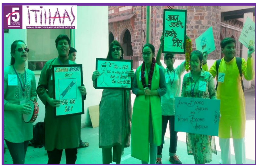
Learning to Campaign – At Election Museum

Students worked at 2 levels... individually and as group members. As a group they formed a political party to understand the dynamics of Indian politics in the context of a democracy. As an individual they worked on contemporary political leaders, from all across the country to understand the electoral wins and failures of the 2019 Lok Sabha Elections.