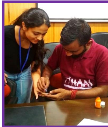
Voter Ink on her finger

The students also got an opportunity to see the ITIHAAS copy of the original Constitution. On this, the mock P.M & her party took oath.